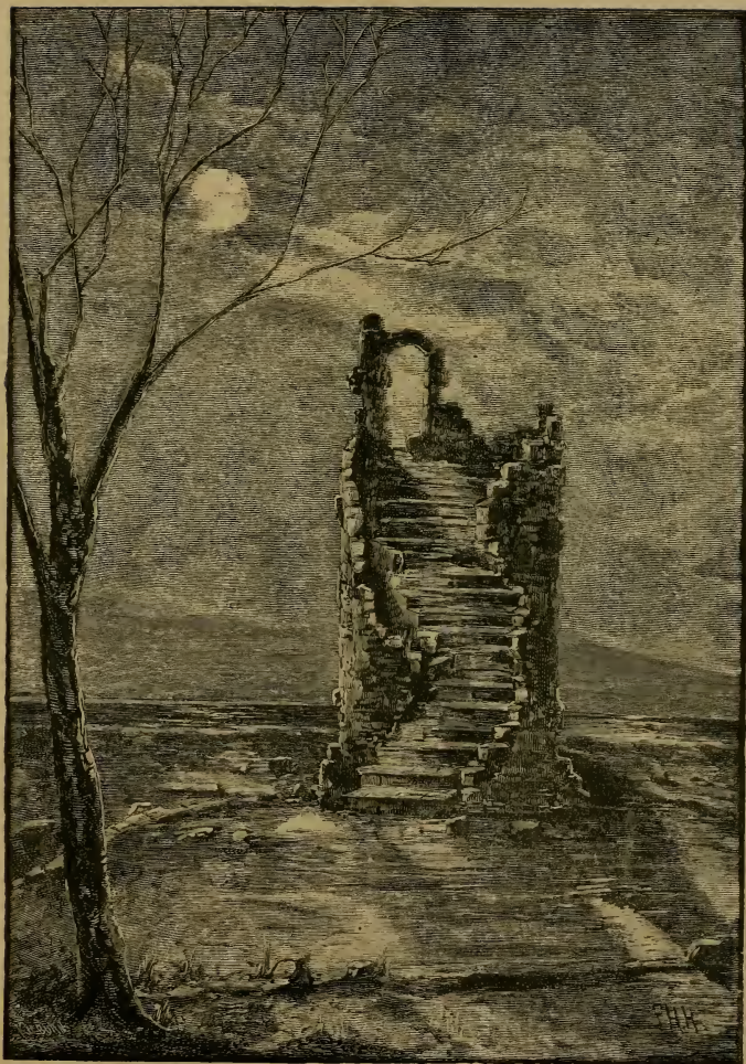
“With one stone stair, symbolic of my life, Ascending, winding, leading up to nought.”— Page 313.